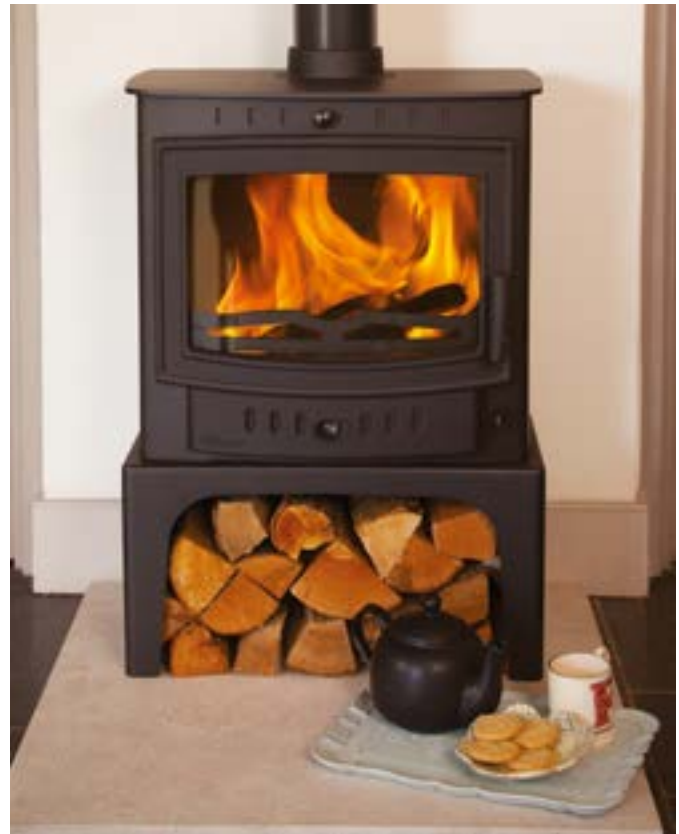
Esprit Solo 8 on optional log store

Optional extras: Ash carrier / Add-in boiler / Log store / Stand / Low canopy / High canopy