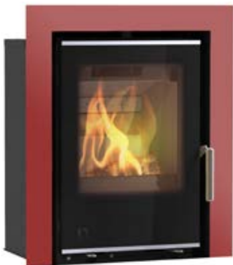
i400 with three-sided Shimmering Rose trim and grey glass supports