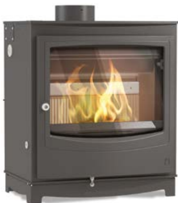
Farrington Catalyst Eco* | 11.4kW

What does Ecodesign Ready mean? High efficiency, low CO, up to 90% less smoke emissions than an open fire.