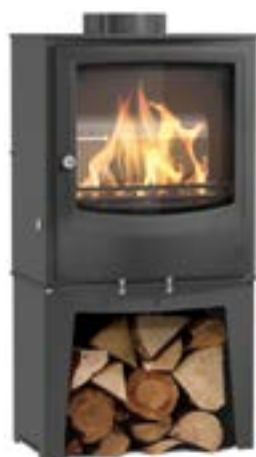
Farrington Medium Eco on log store