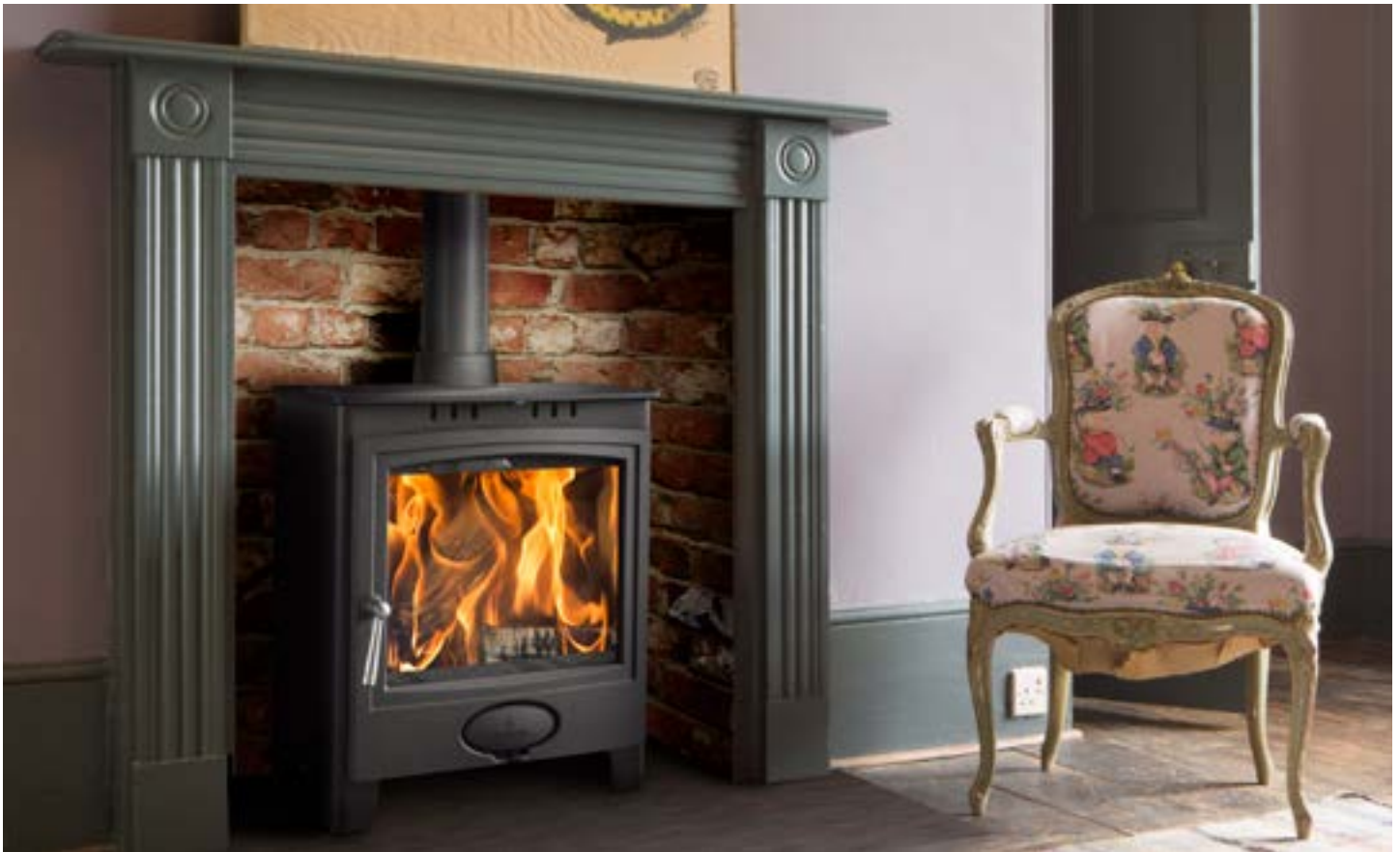
Model shown: Ecoburn Plus 5 Widescreen

The Ecoburn Plus range of stoves is visually astounding, with an extensive viewing glass. Offering more choice over the type of fuel burnt through the Flexifuel System, Ecoburn Plus stoves provide outstanding efficiencies along with all the features that have become synonymous with our stylish contemporary stoves.