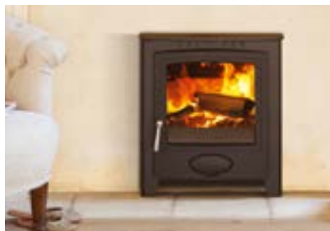
Ecoburn Plus Inset 7