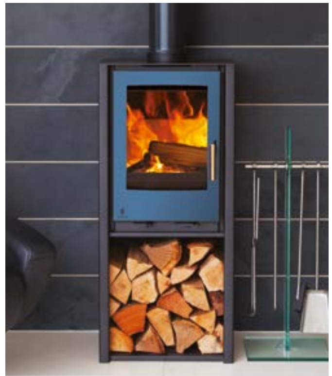
i400 Freestanding Tall with Sky Blue door. Mid and Tall models feature an integrated log store, removing the need for a log basket.