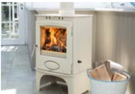
Ecoburn Plus 5 on optional log store in Devon Cream.