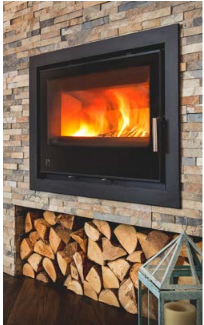
Model shown: i750 shown with four-sided trim type. Three-sided trims are available for fitting any i Series Cassette stove at ground level.