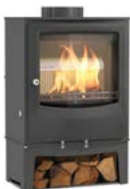
Farrington Medium Eco on stand

*Farrington Catalyst Eco burns wood only