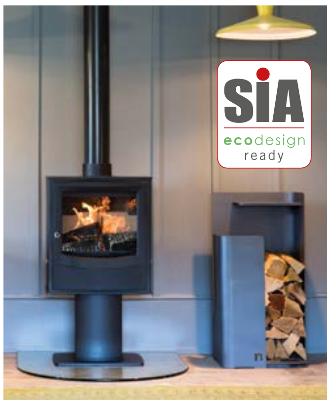
Farrington Small Eco on Pedestal pictured with Tower log store