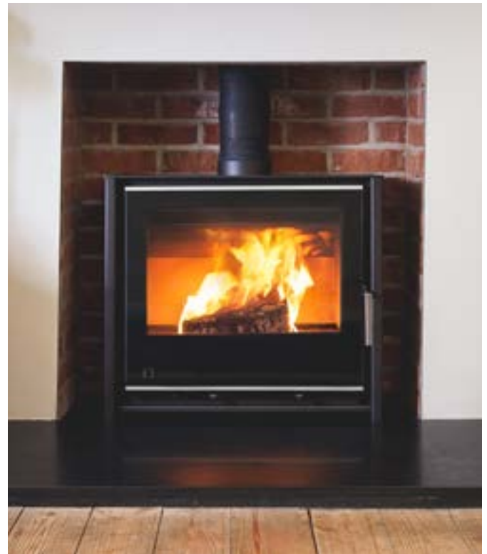
i600 Slimline Freestanding Low with Grey glass supports. Mid model features an integrated log store, removing the need for a log basket.