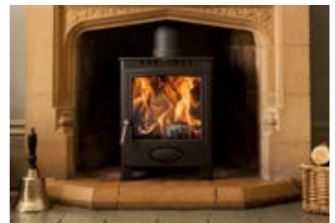
Ecoburn Plus 7 DEFRA

Ecoburn Plus freestanding models are available with 4, 4.9, 7, 9, or 11kW outputs