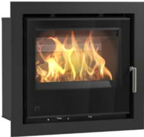
i600 | 7.5kW

Available with 4.9, 6.4, 7.5 or 8.9kW outputs