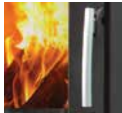
Ergonomically designed handles