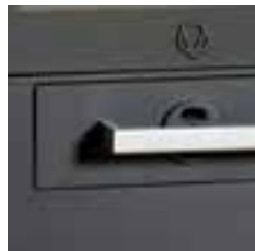
Easy access ash pan