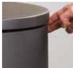
Ergonomically correct adjustment of the air vent