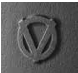
Door, top plate and grate made of high-quality cast iron