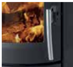
Ergonomically designed handle