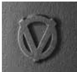
Door, top plate and grate made of high-quality cast iron