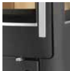
Adjustment of the air supply with one handle