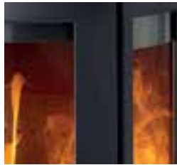
Expansive flame visuals