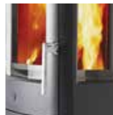
Side windows for an increased flame visual