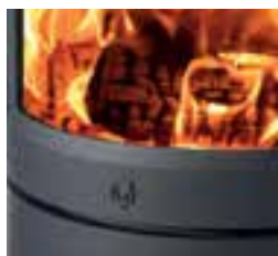
Combustion chamber designed to make it easy to light and clean the stove

Featuring a large curved viewing window and expansive firebox, which can take logs of up to 350mm, the Lincoln woodburning stove offers soaring flame visuals. Producing a generous 7kW high efficiency heat output, this large format stove is suitable for spacious living areas.