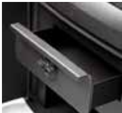
Large capacity ash pan

Aura 1 has a large fire chamber with ample fuel storage space beneath the innovative door which opens when pressed gently.