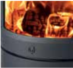
Combustion chamber designed to make it easy to light and clean the stove

The Bolton is a three-sided stove featuring viewing windows on the left and right hand sides of the firebox, which allow its impressive flames to be appreciated wherever you are in the room. Employing a large combustion chamber with powerful airflow systems, the Bolton easily generates an ample heat output of 7kW at an exceptional 80% efficiency.