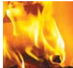
Expansive flame visuals