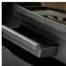
Large capacity ash pan