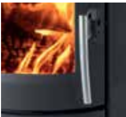
Ergonomically designed handle