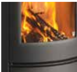
Combustion chamber designed to make it easy to light and clean the stove

The Shape 2 is offered as either a dedicated woodburning or multi-fuel model, and features a tall firebox with a curved window for a breath-taking flame view. These versatile stoves are available in either top or rear flue options and feature Varde's AirBox system for an external air supply if required.