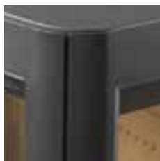
Elegant rounded corners