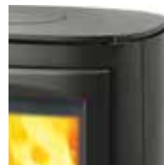
Elegant rounded corners