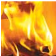
Expansive flame visuals