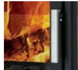
Ergonomically designed handles