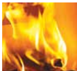
Expansive flame visuals