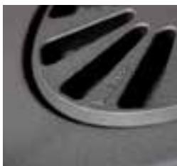
Cast iron disc grate in base for easy ash removal