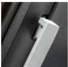
Contrasting handle detail