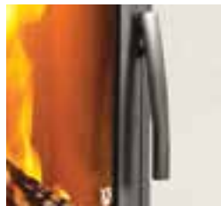
Ergonomically designed handle